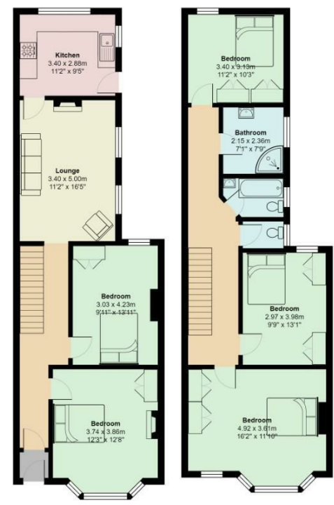
Whitchurch Road, Heath

Total Area: 137.5 m 2 ... 1480 ft 2 All measurements are approximate and for display purposes only